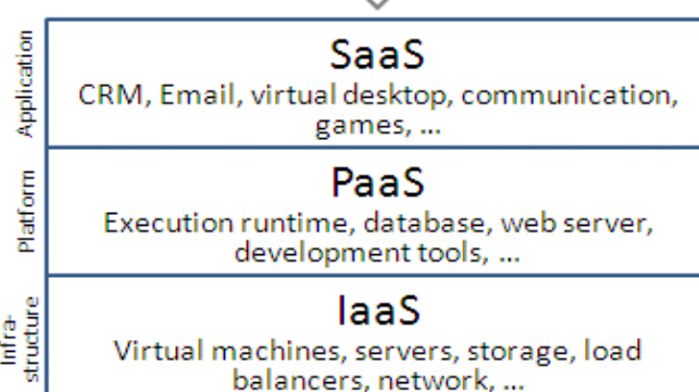
Fig-1: SPI Model

We present here a categorization of security issues for Cloud Computing focused in the so-called SPI model (SaaS, PaaS and IaaS), identifying the main vulnerabilities in this kind of systems and the most important threats found in the literature related to Cloud Computing and its atmosphere. A peril is a prospective attack that may lead to a misuse of information or possessions, and the term defencelessness refers to the flaws in a system that allows an attack to be successful. There are some surveys where they focus on one service model, or they focus on listing cloud security issues in general without distinguishing among vulnerabilities and threats. Here, we present a list of vulnerabilities and threats, and we also indicate what cloud service models can be affected by them. Furthermore, we describe the relationship between these vulnerabilities and threats; how these vulnerabilities can be exploited in order to carry out an attack, and also current counteract channel related to these threats which try to solve or improve the identified problems. The survey is based on the following points.